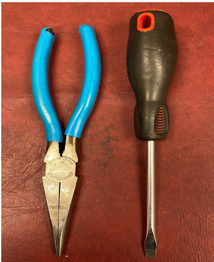
Tools to use: Needle Nose Pliers and Flat Head Screwdriver.